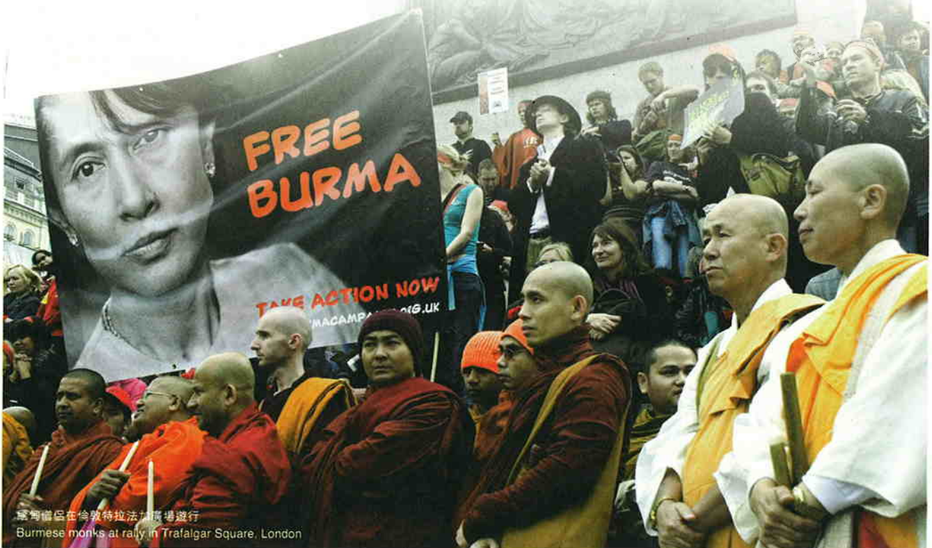
臺灣僧侶在倫敦特拉法加廣場遊行 Burmese monks at rally in Trafalgar Square, London